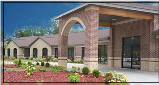
Arborwood Lodge Wisconsin Rapids Assisted Living Community